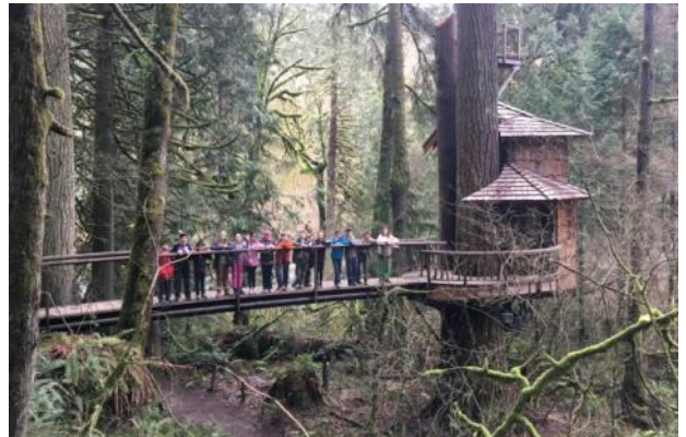
6th grade students at Treehouse Point

Students use technology on a daily basis to communicate, collaborate, research, analyze, and demonstrate their learning through projects. A variety of digital tools are integrated into the learning experiences for all students.