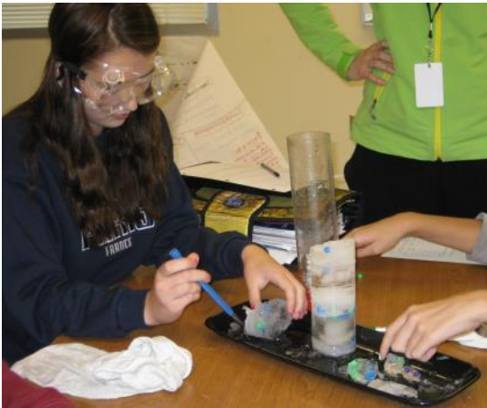
9th grade student working on climate change project for high school science.

Mission Statement: To prepare every student for success in college, career, and citizenship through personalized, rigorous and relevant learning experiences.